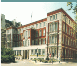
Savoy Place, London (IEE HQ)

Provide an extensive range of lectures, meetings, conferences, seminars, residential vacation schools and publications.