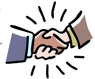
For further information about joining the IEE, please see our website